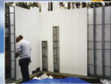
Interior Wall Access